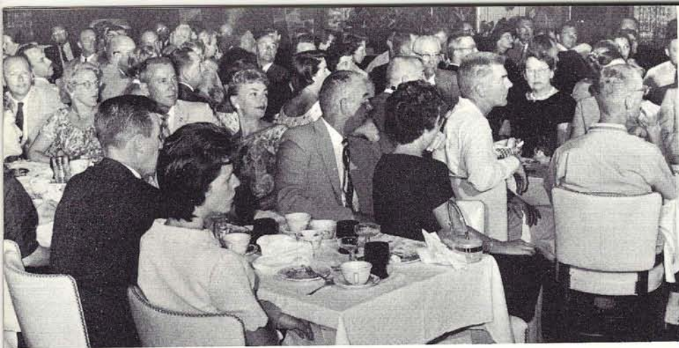
A Hopeful Group Listens for their Door Prize Numbers.