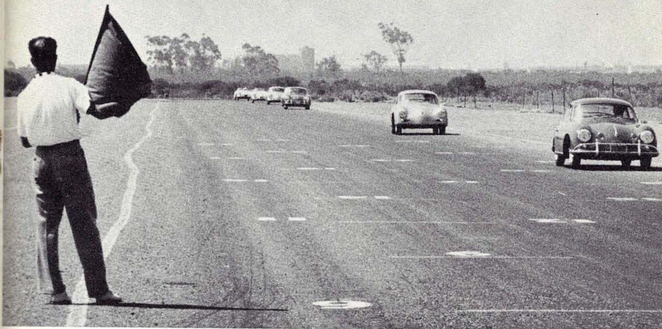
Once Around Slowly in Drivers' Clinic.