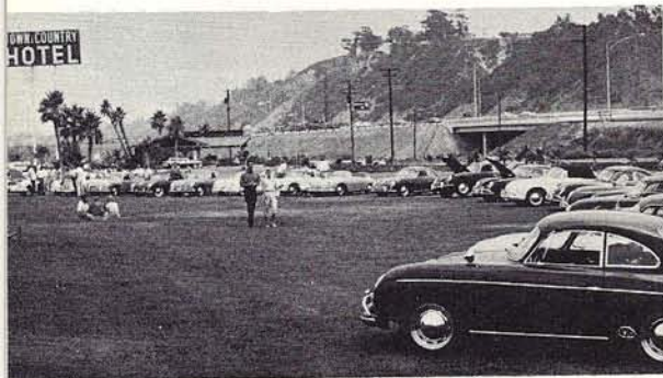
Line-up at Beginning of Concours