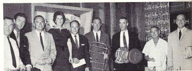
Door Prize Winners